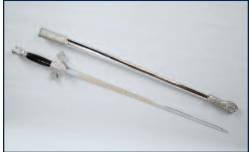
Black Handled Sword with Scabbard