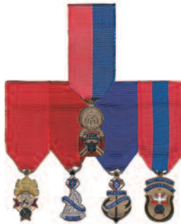
Diagram 5 Past State Deputy Former District Master Former District Deputy Past Grand Knight Past Faithful Navigator