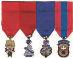
Diagram 4 Former District Master Former District Deputy Past Grand Knight Past Faithful Navigator