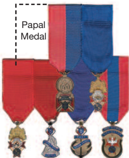
Diagram 7 Papal Medal Past State Deputy Former Vice Supreme Master Former District Master Former District Deputy Past Grand Knight Past Faithful Navigator